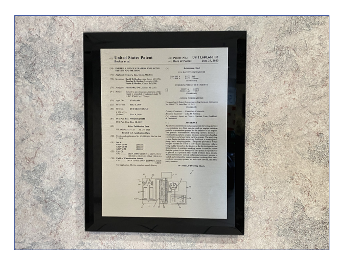
The latest patent joins Sensors, Inc.'s other patents in the lobby of the Saline, Michigan headquarters.