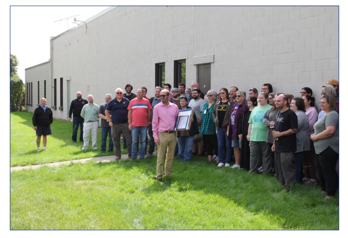
Sensors' Saline Michigan employees join in celebrating the latest patent. {\tt {\tt S}}