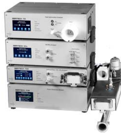
SEMTECH ECOSTAR Gaseous System