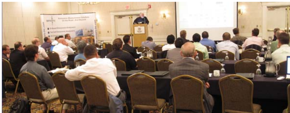
2011 SUN Conference

Thank you all for another successful SEMTECH User Network conference. The SUN Conference, which took place in Ann Arbor, Michigan last week, saw over 80 attendees, representing 35 different companies. A special thank you to our guest speakers, who brought worldwide perspectives to the regulatory aspects of the industry, and to the applications and evaluations of PEMS. Presentations are now available to our existing customers through the SEMTECH customer portal.